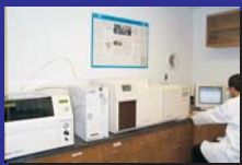
Organics by GC/FID/MS