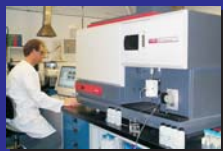
Metals by ICP, GFAAS, CVAAS